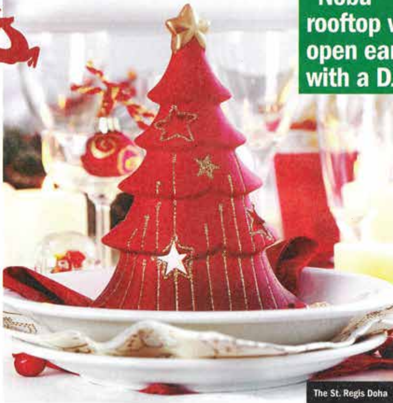
The St. Regis Doha

“Nobu rooftop will open early with a DJ”