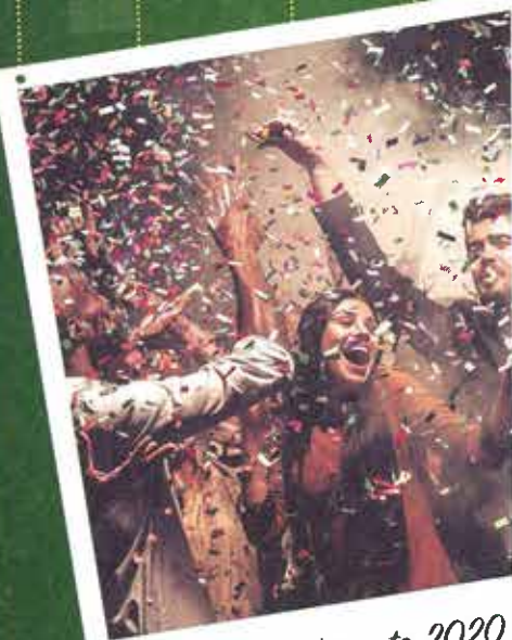
Countdown to 2020