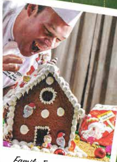
Family Fun Activities